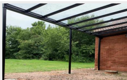
Designo, Ixoria & Olympiad