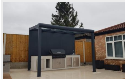
Solo Edition, Freestanding Veranda