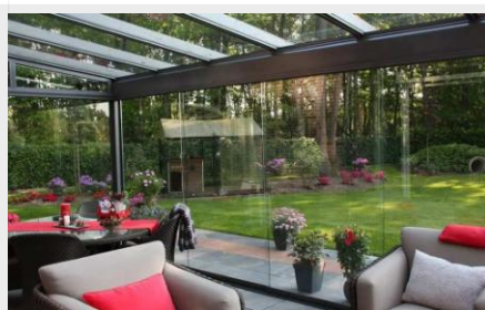
Bespoke Glass Room

When it comes to making the garden a part of your home, DiatoStyle's Garden and Glass Rooms are perfect in terms of style, design and versatility. Using unique designs, we are sure to have a system to offer that will be in keeping with the appearance and function that you are looking to achieve and within an affordable budget. They are a great alternative solution to a traditional Conservatory.