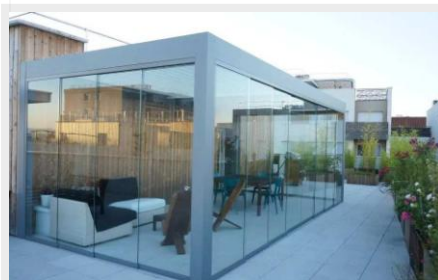
Bioclimatic Glass Room