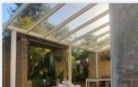
Cachet Edition Bespoke Veranda

Bespoke Aluminium Veranda supplied and installed by expert craftsmen. Depending on the range and style, projections of up to 6 metres can be accommodated and in all cases, unlimited widths. We are able to offer roof materials in polycarbonate, or toughened, laminated and self-cleaning glass.