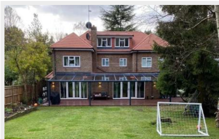
Supreme Edition Bespoke Veranda