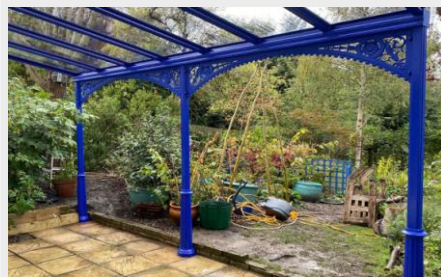
Classic Victorian Style